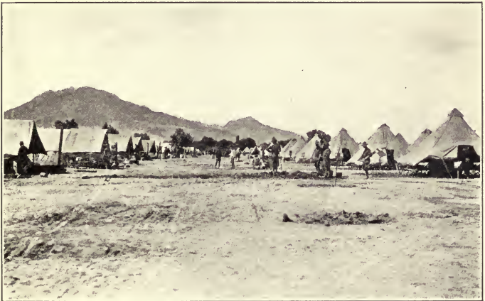
REGIMENTAL STREET AT CAMP COTTON